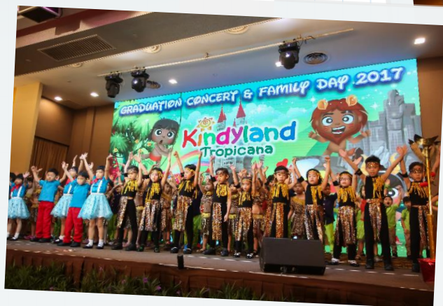
Superstars in the making