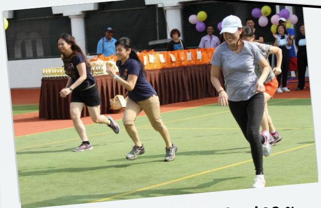
Mums and dads have fun too ~