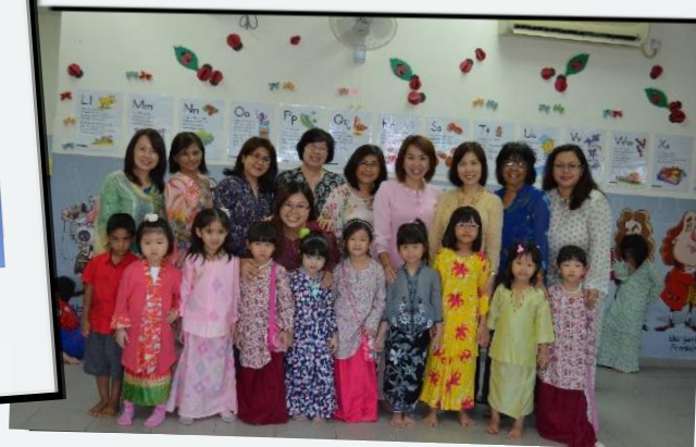
Selamat Hari Raya dari semua murid dan cikgu Kindyland