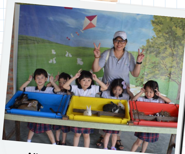
All ears @ the Rabbit Farm