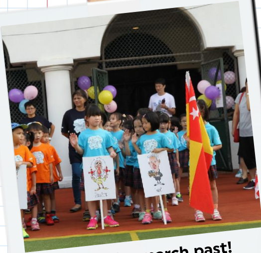
Ready for march past!