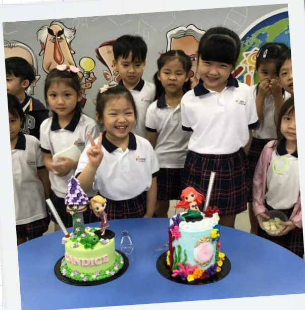
It's my birthday!