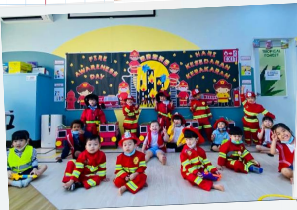
Fire Awareness Day