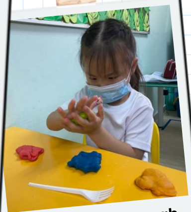
Playing with Dough