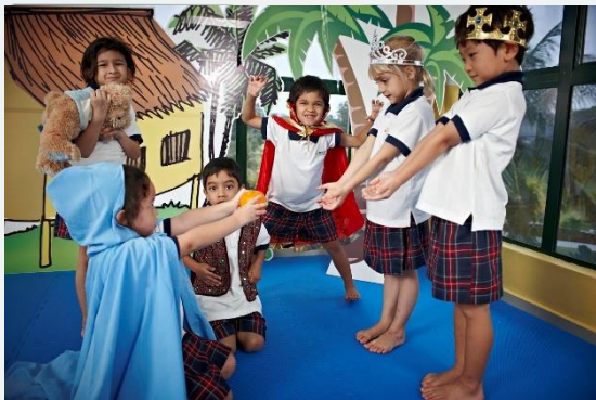
Speech & Drama