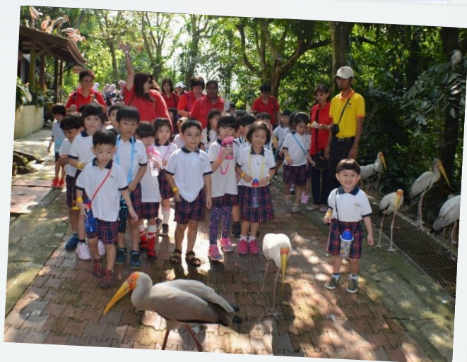
Walking with storks @ the Bird Park