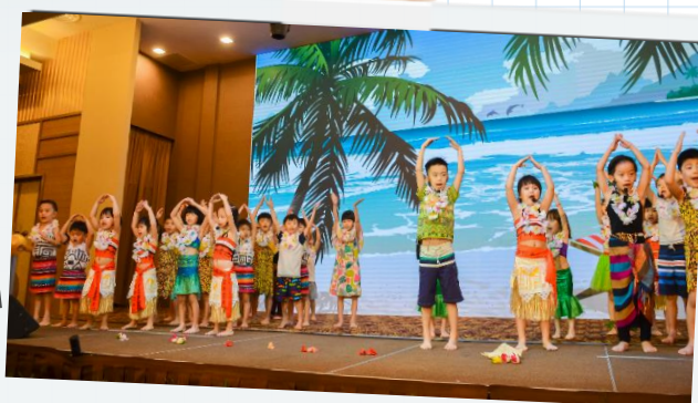
The sky is the limit