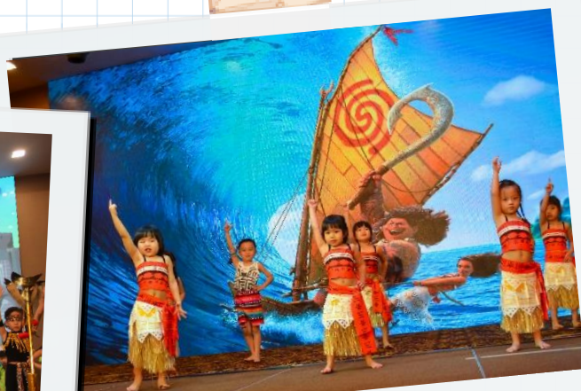
Making waves on stage