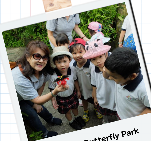
Exploring Butterfly Park