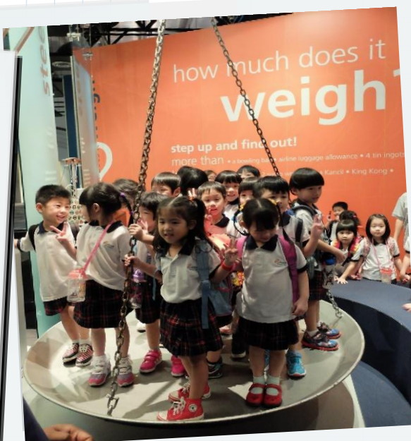
Weighing in @ the Royal Selangor Factory