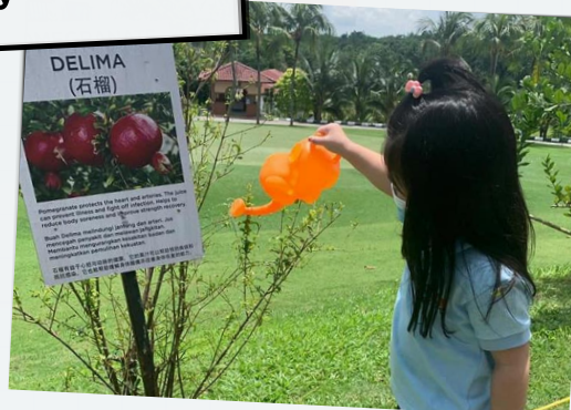
Outdoors with Nature