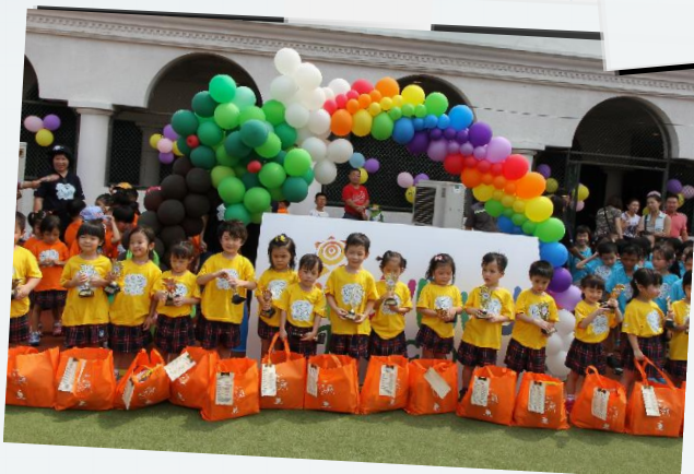
We are the CHAMPIONS