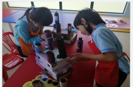
Arts & Crafts