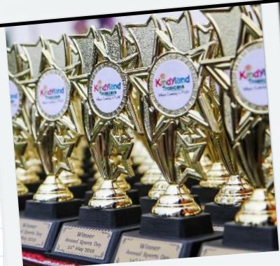
Everyone is a WINNER