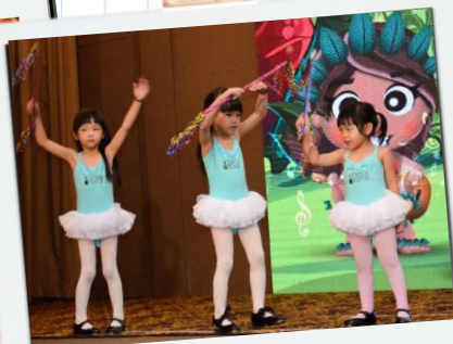
Happy little feet